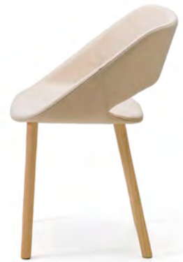
Kabira Armchair C-C-1051

Armchair with steel rod sled base finished in white, black, gray/ brown, copper, brass, titanium or chrome. Shell in natural or painted ashwood, or polyurethane foam upholstered with fabric or leather.