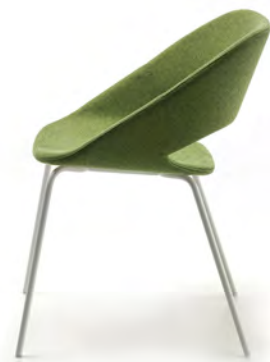
Kabira Armchair C-C-1037