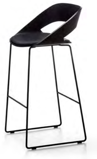
Kabira Stool C-C-1039-counter

Armchair with round tubular steel 4 legged base finished in white, black, gray/brown, copper, brass, titanium or chrome. Shell in natural or painted ashwood, or polyurethane foam upholstered with fabric or leather.