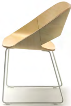
Kabira Armchair C-C-1038