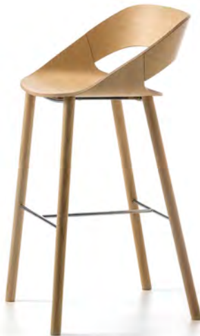
Kabira Stool C-C-1052

Armchair with natural or painted ashwood base finished in white, black, gray/brown, copper, brass, titanium or chrome. Polyurethane foam upholstered with fabric or leather.